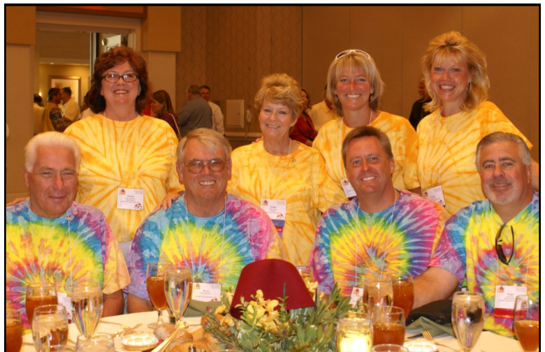
Yes, Boulder City is in the house! The district expected great things from Sunrise Rotary and we met the challenge. The President selected these shirts WITHOUT having any margaritas before shopping!