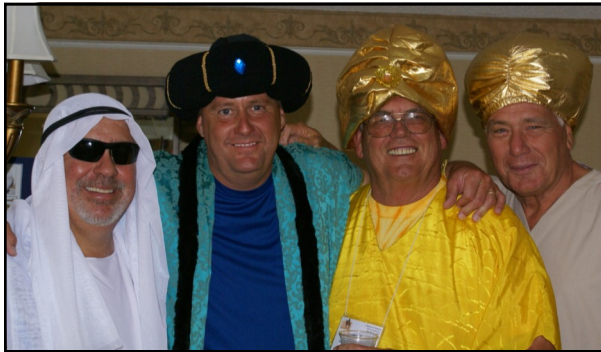
The boys had TOO MUCH FUN!