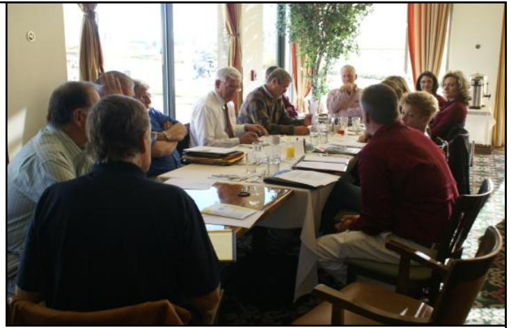
The board met with DG Roger with updates from our programs, projects, events, budgets and overall health of our club.